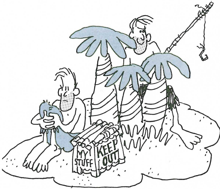
According to Locke, how is personal property protected in a state of nature?

Locke believed that most people understood this law of nature through the use of their reason and followed it because their consciences obliged them to do so. Not all humans were reasonable or good, however. There might even be disagreement about what the "laws of nature" were. If there were no government, there would be no one with the right to interpret or enforce these laws.