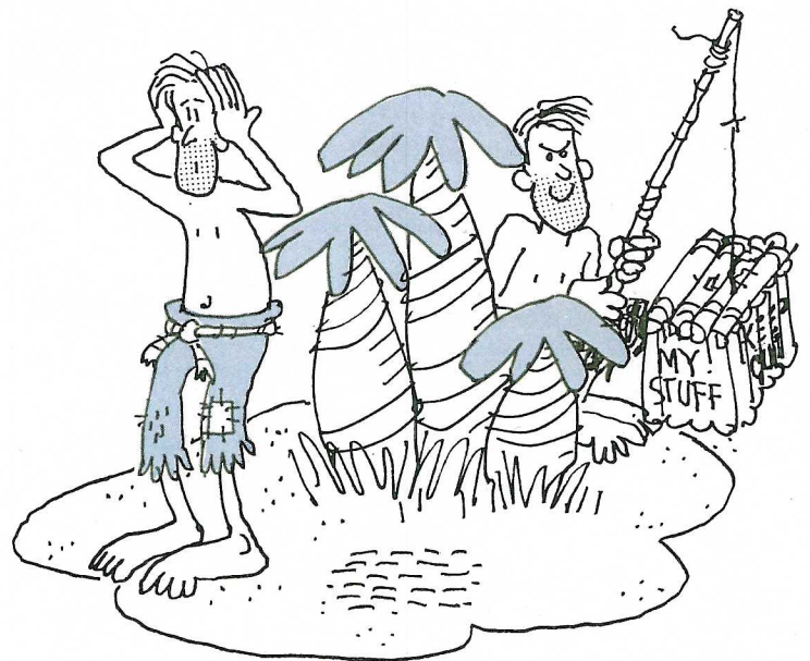
Why did Locke believe it was necessary for people to create governments?