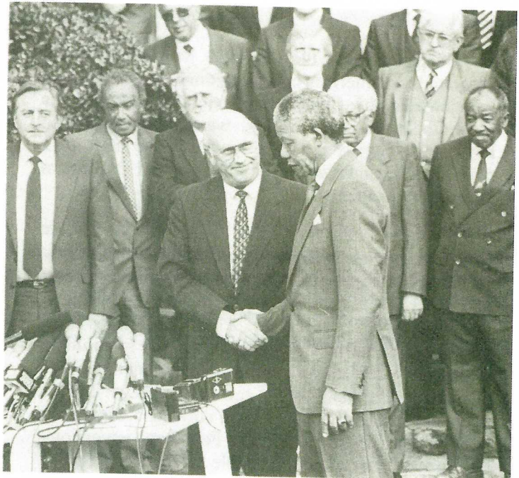
Did the end of white rule in South Africa in 1993 result in a state of nature? Why?